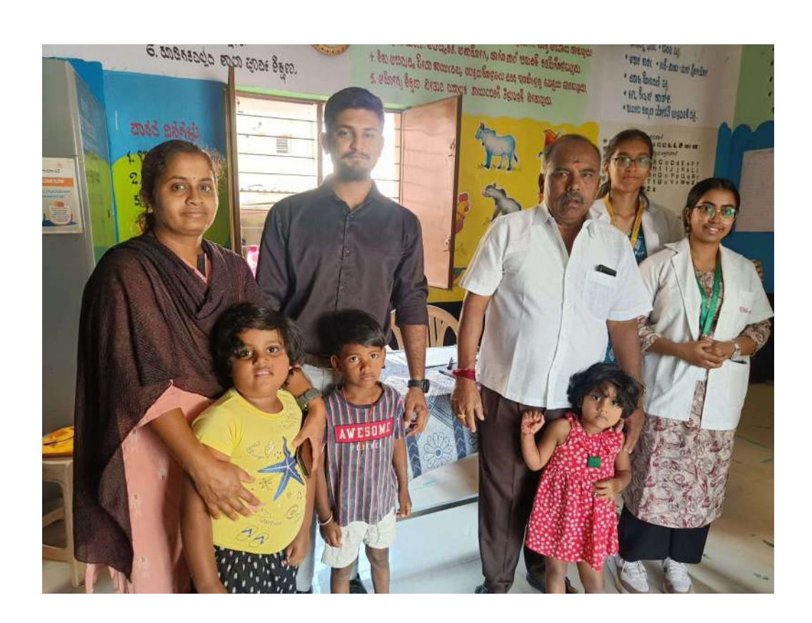
Polio booth at Bidarahalli Anganwadi