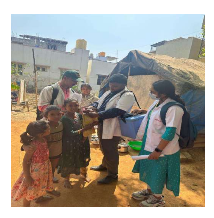
Door to Door polio vaccine